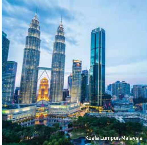
Kuala Lumpur, Malaysia