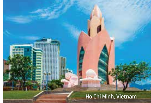
Ho Chi Minh, Vietnam