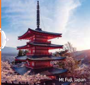
Mt Fuji, Japan