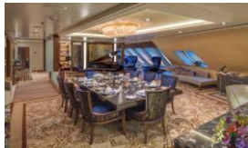
Palace Villa 皇宫庭院别墅