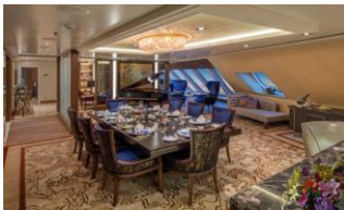
Palace Villa 皇宫庭苑别墅