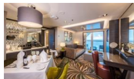
Palace Penthouse 皇宫行政套房