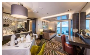
Palace Penthouse 皇宫行政套房