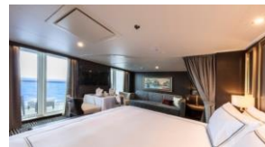
Palace Suite 皇宫套房