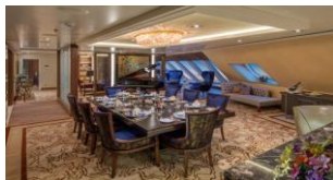
Palace Villa 皇宫庭院别墅

Bintan Island Ferry & Land Transfer Service to Plaza Lagoi Bay - SGD 30/pax