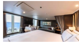
Palace Suite 皇宫套房