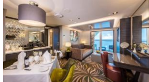
Palace Penthouse 皇宫行政套房