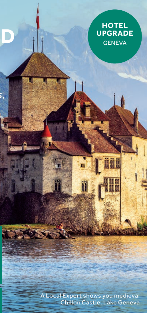
A Local Expert shows you medieval Chillon Castle, Lake Geneva