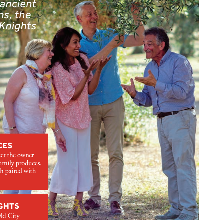
Sample olive oil at the farm where it's produced in Trapani

Uncover the unique legacy of this culturally rich island, once occupied by ancient Greeks and Romans, the Saracens and the Knights of St. John.