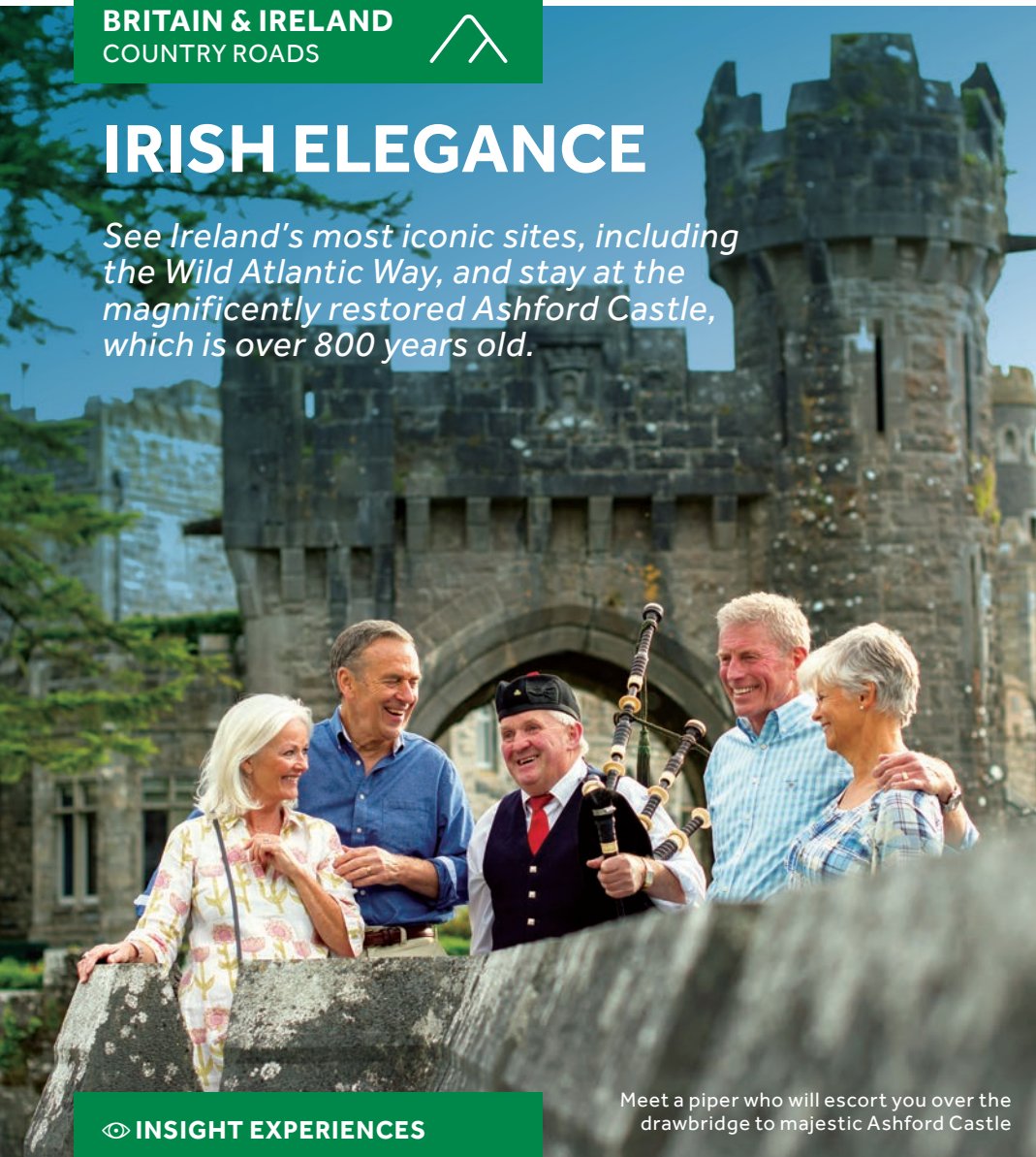
Meet a piper who will escort you over the drawbridge to majestic Ashford Castle

See Ireland's most iconic sites, including the Wild Atlantic Way, and stay at the magnificently restored Ashford Castle, which is over 800 years old.