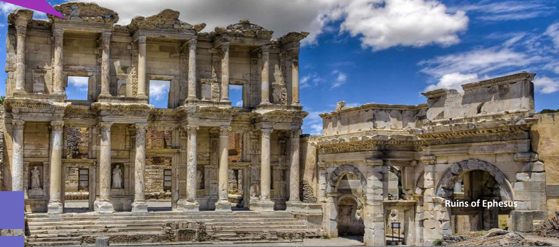
Ruins of Ephesus

Istanbul – Bursa – Pamukkale – Kusadasi – Canakkale – Istanbul