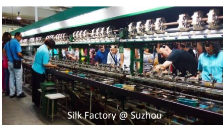
Silk Factory @ Suzhou