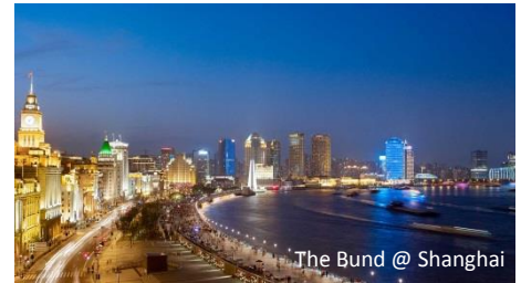
The Bund @ Shanghai