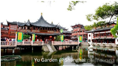
Yu Garden @ Shanghai