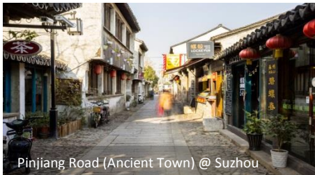
Pinjiang Road (Ancient Town) @ Suzhou