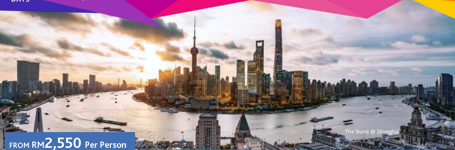
The Bund @ Shanghai