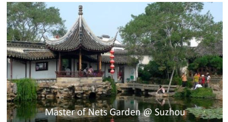
Master of Nets Garden @ Suzhou