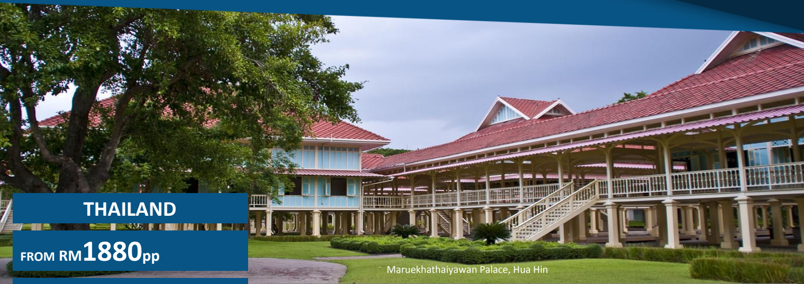
Maruekhathaiyawan Palace, Hua Hin