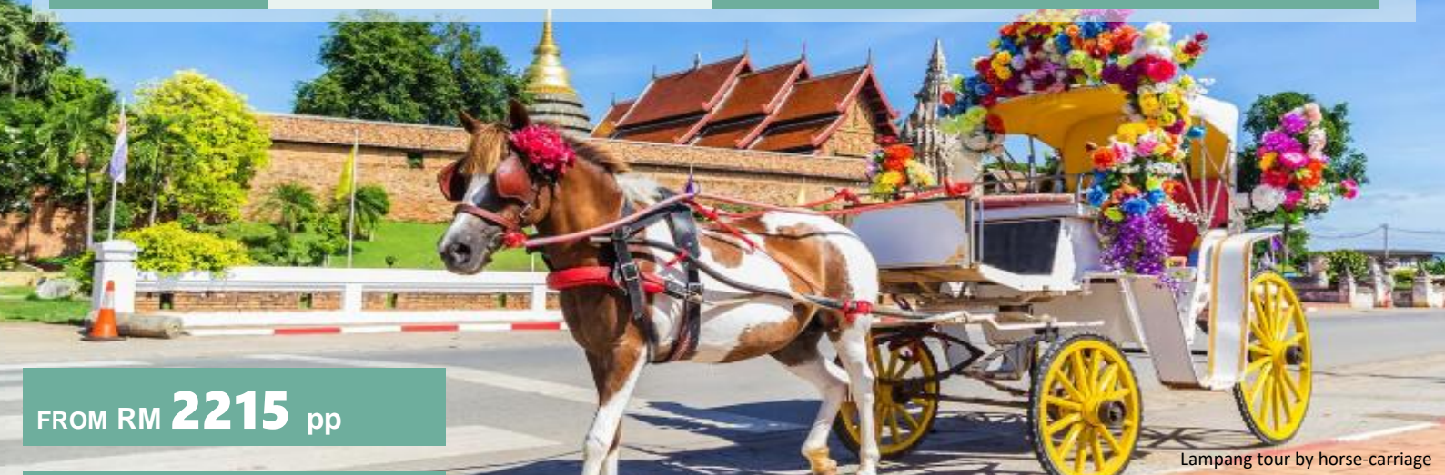
Lamphang tour by horse-carriage