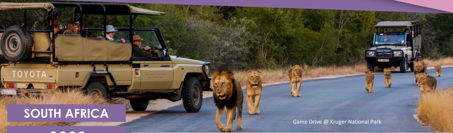
Game Drive @ Kruger National Park

Johannesburg –Kruger National Park-Johannesburg-Cape Town