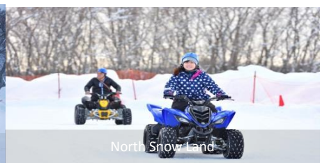
North Snow Land