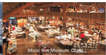
Music Box Museum, Otaru