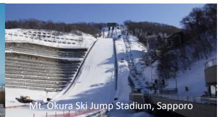
Mt. Okura Ski Jump Stadium, Sapporo