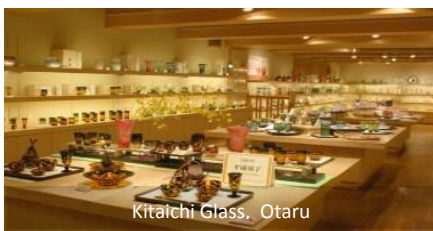
Kitaichi Glass, Otaru