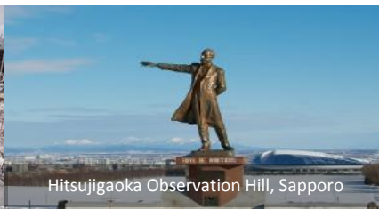
Hitsujigaoka Observation Hill, Sapporo