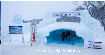
Ice Festival, Lake Shikotsu