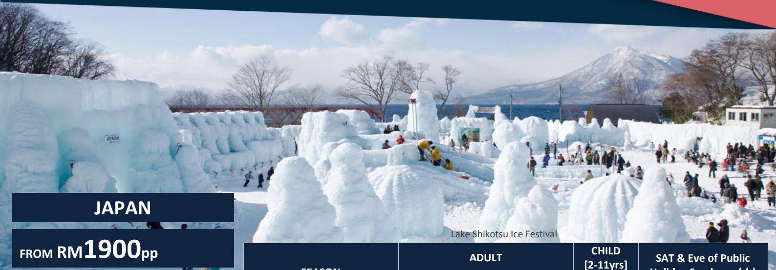
Lake Shikotsu Ice Festival