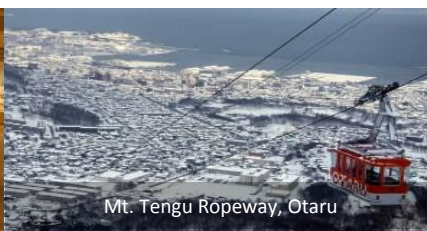
Mt. Tengu Ropeway, Otaru