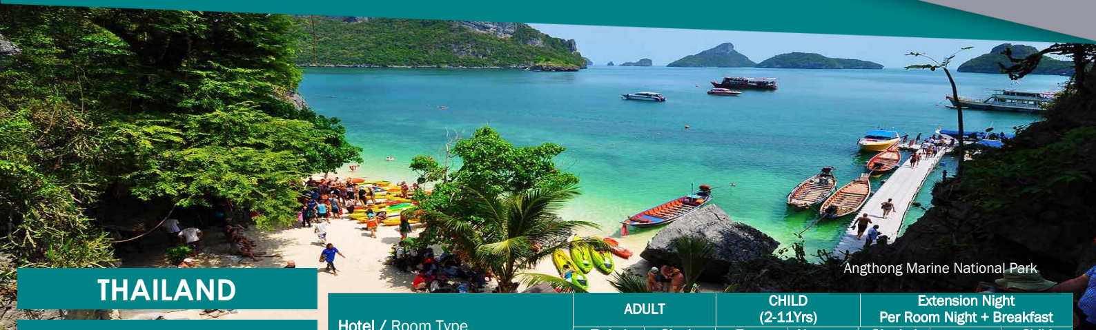
Angthong Marine National Park