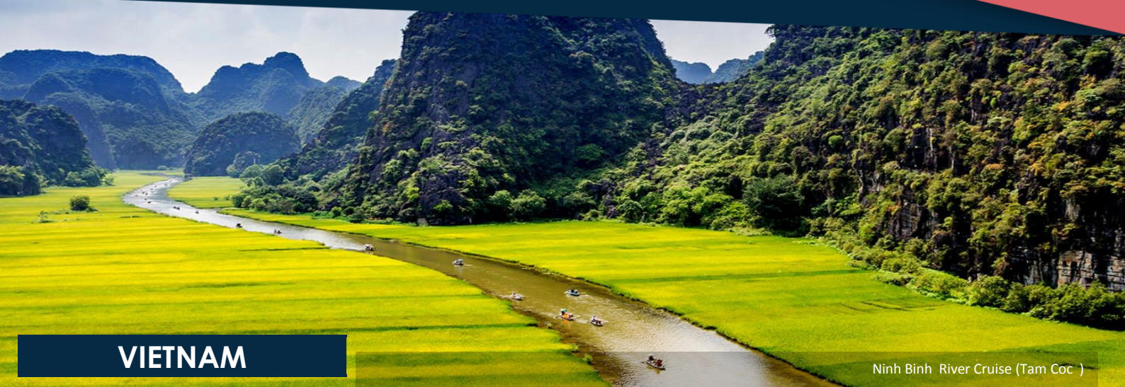
Ninh Binh River Cruise (Tam Coc )