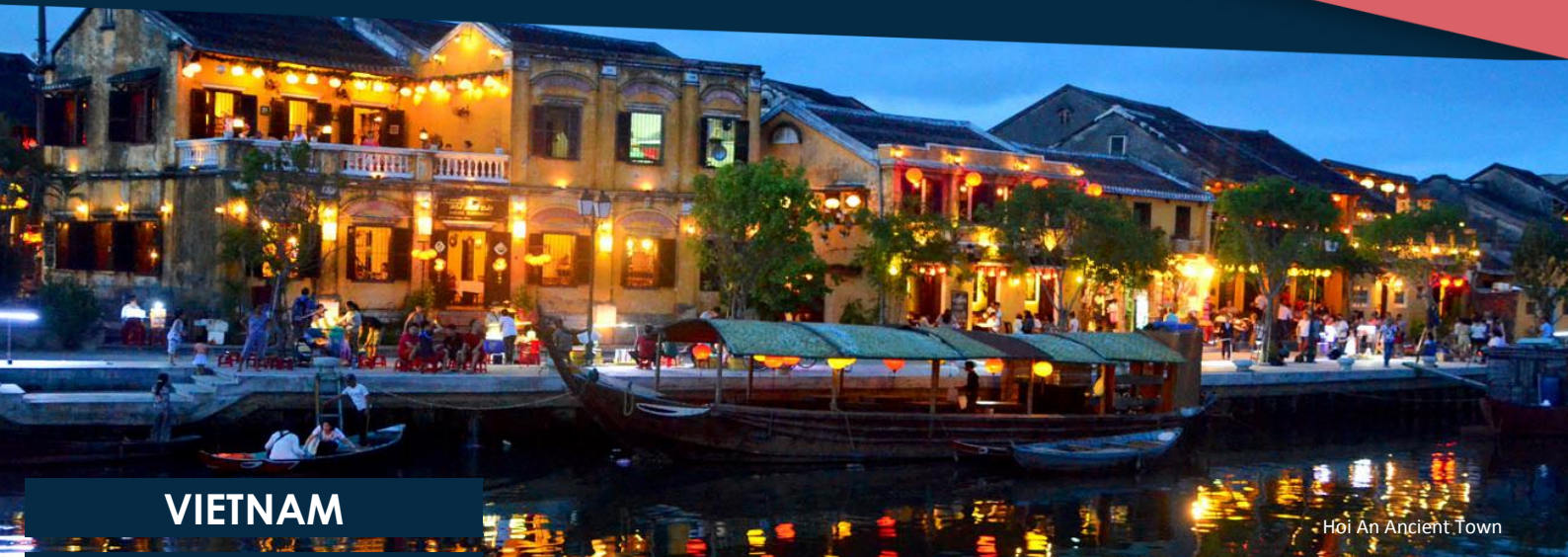
Hoi An Ancient Town