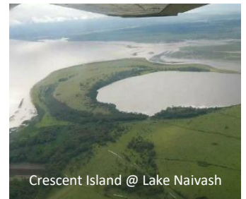
Crescent Island @ Lake Naivasha

Check out and depart to Lake Nakuru National Park (92kms/Approx. 2hrs). Arrive Lake Nakuru National Park, start a mid-morning game driver. After which, check-in and lunch at lodge. Afternoon, game drive begins.