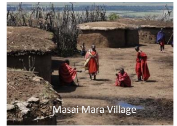
Masai Mara Village

Depart to Lake Naivasha (230kms/Approx. 5hrs). Arrive at the lodge and check in. Lunch at lodge, afternoon transfer to the lake, enjoy 1hour Boat Ride on Lake Naivasha. Land on Crescent Island and enjoy a 1hour walk among its resident animals which include Giraffe, Gnu, Zebra, Impala, Gazelle, Dikdik, Mongoose as well as various birds.