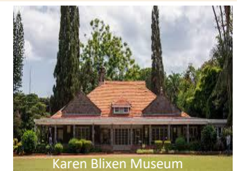
Karen Blixen Museum

Depart for Nairobi (103kms/Approx. 2hrs) and visit Karen Blixen Museum – the museum belongs to a different time period in the history of Kenya. Giraffe Centre -the only sanctuary in the world within a capital city that enables you to come into very close contact with the world's tallest yet endangered animal, the giraffe. Farewell BBQ lunch at Carnivore Restaurant . After lunch transfer to Nairobi airport for departure for departure.