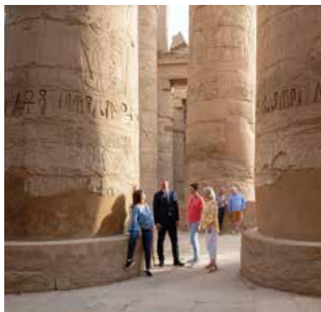
LUXOR TEMPLE, LUXOR