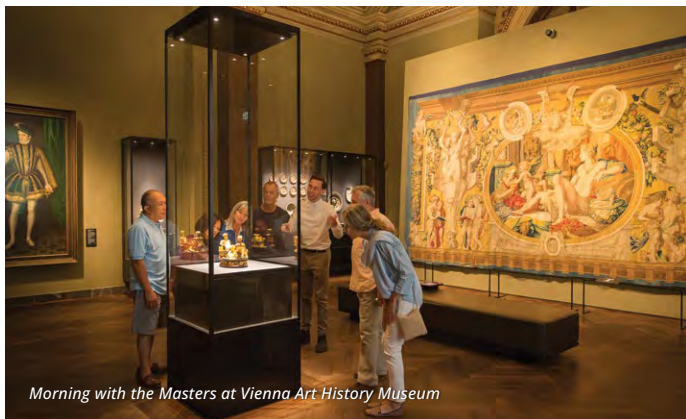
Morning with the Masters at Vienna Art History Museum