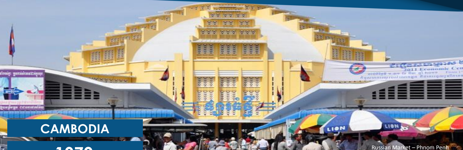
Russian Market – Phnom Penh