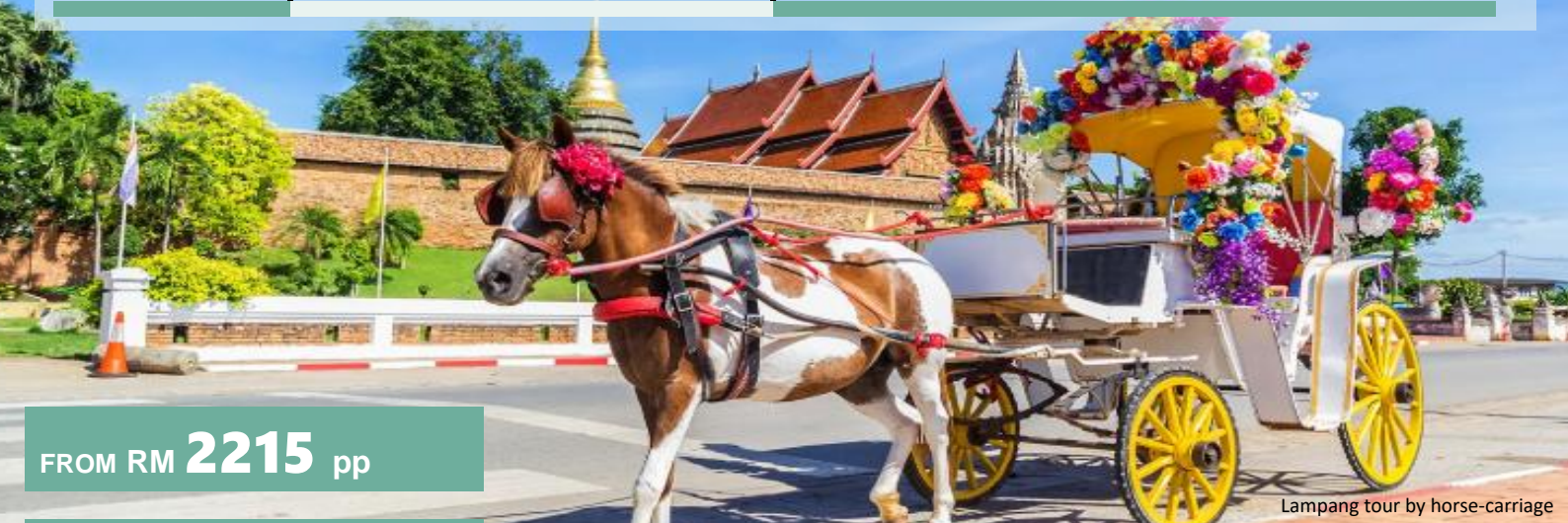
Lampang tour by horse-carriage