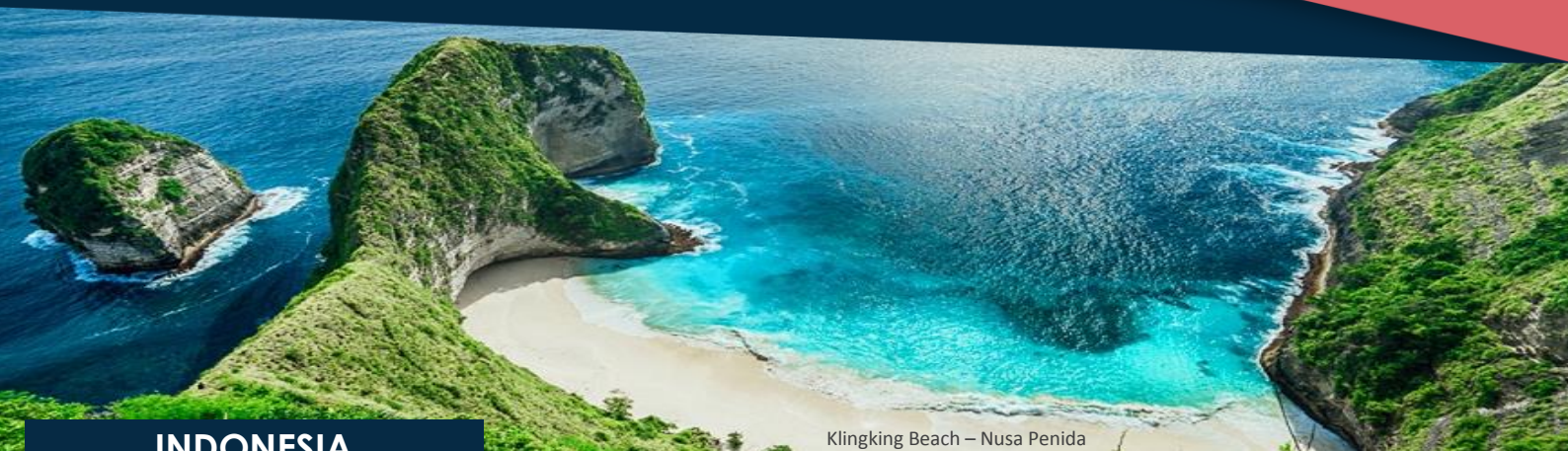
Klingking Beach – Nusa Penida