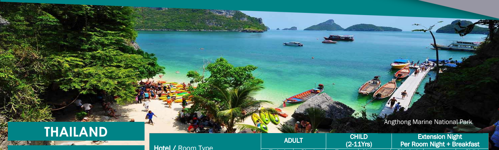
Anghong Marine National Park