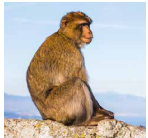
BARBARY APES, GIBRALTAR