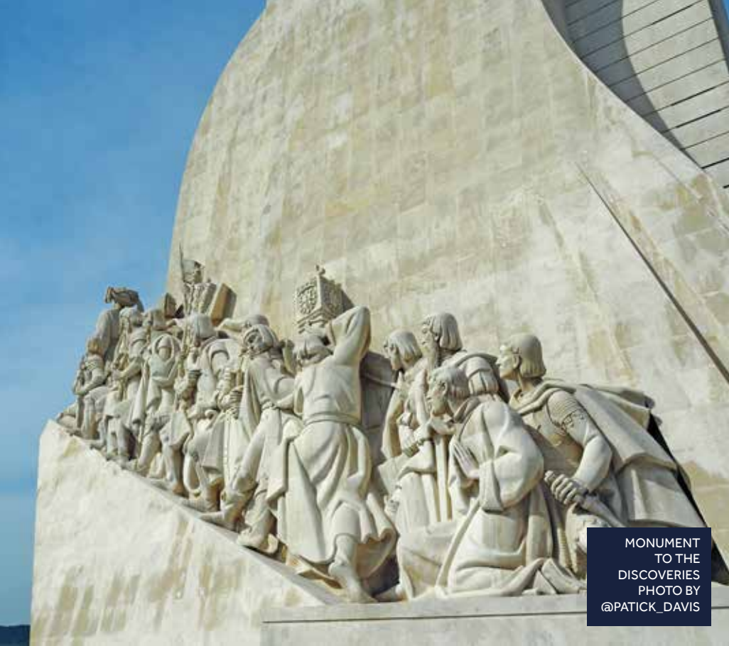
MONUMENT TO THE DISCOVERIES