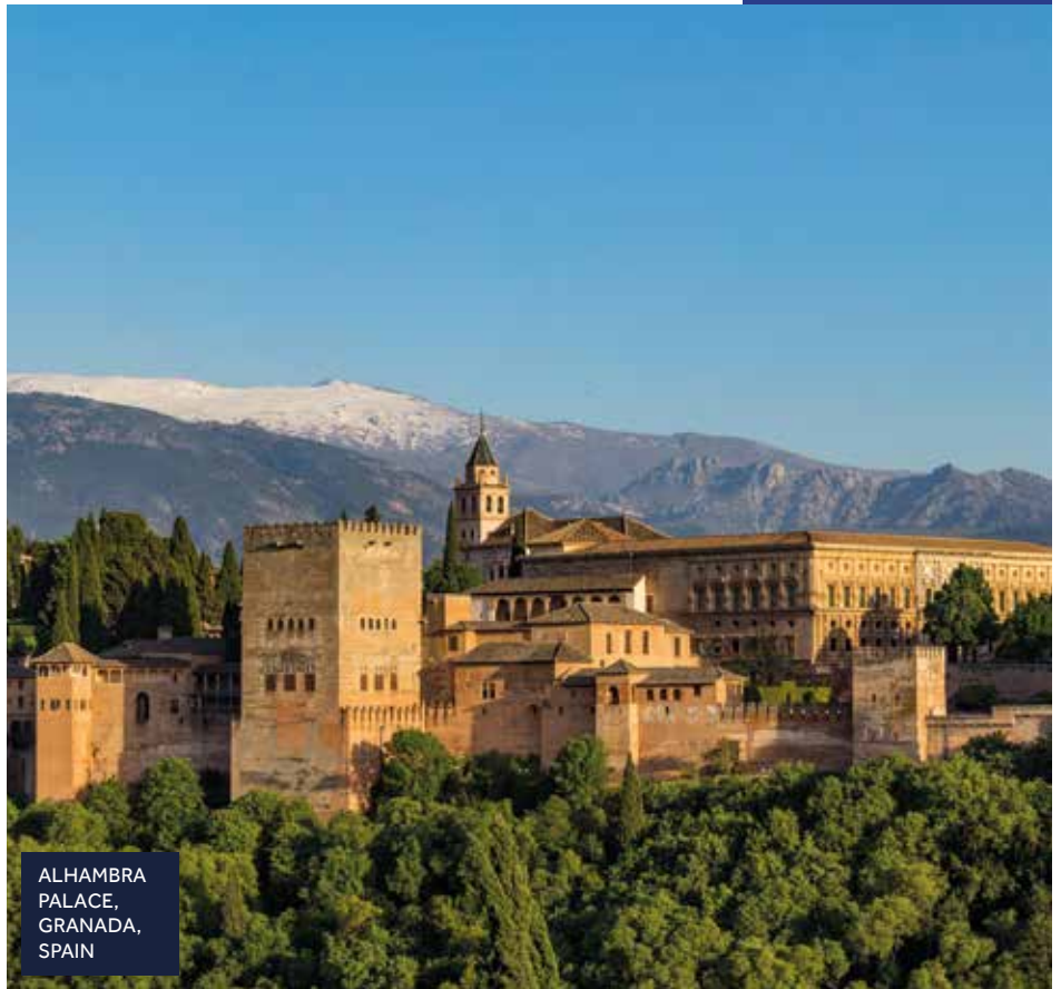
ALHAMBRA PALACE, GRANADA, SPAIN