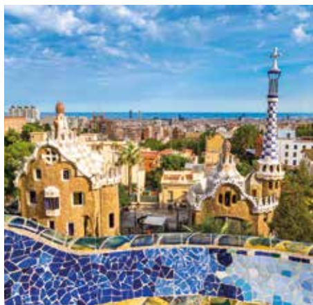
PARK GÜELL, BARCELONA (OPTIONAL)