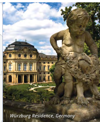
Würzburg Residence, Germany