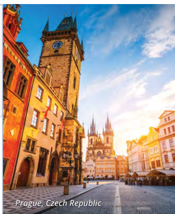
Prague, Czech Republic