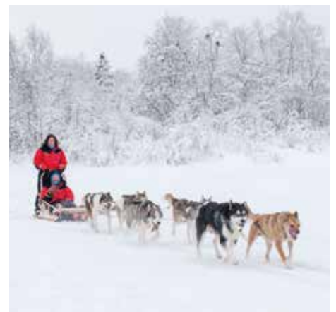
DOG SLEDDING (OPTIONAL), ALTA