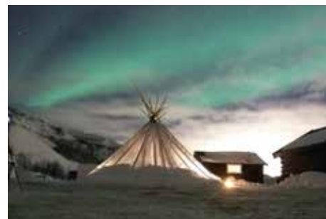
TOP RATED HIGHLIGHT Witness the wonder of the Aurora Borealis. (Day 2, Ivalo)

This trip operates both classic and small group departures. You can also book your own private group with as few as 12 travellers.