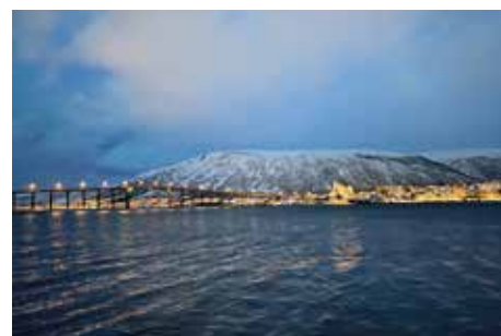
TOP RATED HIGHLIGHT Discover beautiful scenery in Tromsø with your Travel Director. (Photo by Yeo Yong Meng, Day 7, Tromsø)