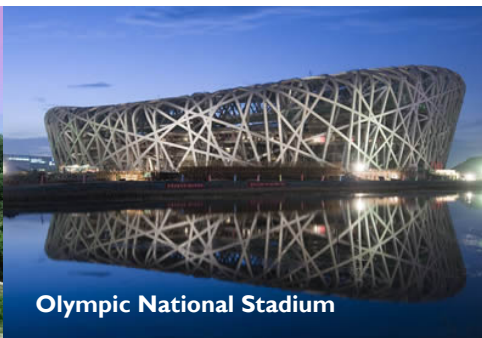
Olympic National Stadium