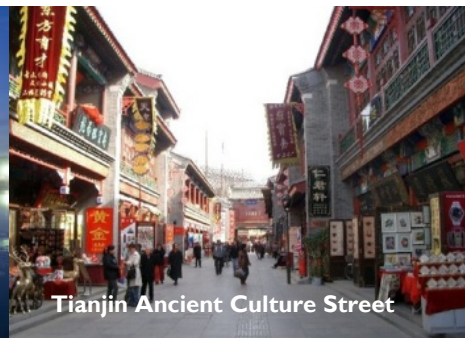
Tianjin Ancient Culture Street